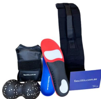
fasciitis.com.au Prefabricated Orthotic